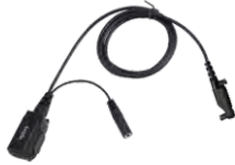
ACN-02P Mic and PTT button with VOX and 3.5mm Jack Receive-only Earpiece (IP54)

External earpieces that are used in combination with the ACN-02-P