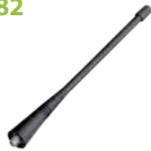
Ships with Standard Long Antenna