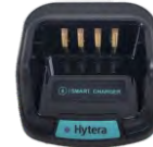
CH10L30 Drop-In Single Unit Charger