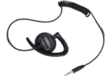
EH-02 Receive-Only Swivel Earpiece