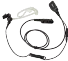
EAN24-P Transparent Acoustic Tube Surveillance Earpiece with microphone and in-line PTT button