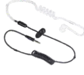
EA-01 Receive-Only Earpiece with Transparent Acoustic Tube