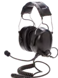
ECN21-P Heavy-duty noise-cancelling headset with PTT and boom microphone