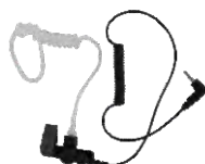
EAS03 ① Receive-Only Transparent Acoustic Tube Earpiece