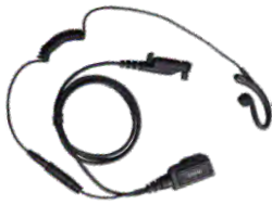
EHN26-P C-style Earpiece with microphone and in-line PTT button

External earpieces and microphones that attach directly to the radio