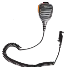
SM26N2-P ① Palm PTT Mic with Speaker and emergency button (IP54)