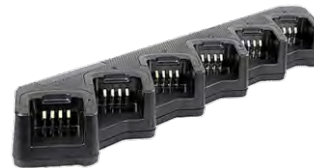
MCL39 6-Radio Multi-Unit Charger