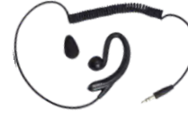
EH-01 Receive-Only C-Style Earloop