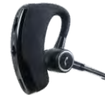
ESW08 Bluetooth Earpiece with PTT button and microphone