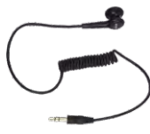
ES-01 Receive-Only Earbud