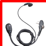
Earbud with on-MIC PTT & VOX ESM12