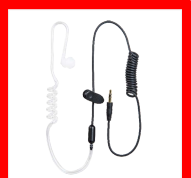
Earbud with Transparent Acoustic Tube (Receive-Only) EA-01