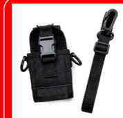
Nylon Carrying Case (not swivel)(black) NCN001

Note: Pictures above are for reference only and may vary from actual product.