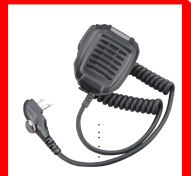
Remote Speaker Microphone SM08M3