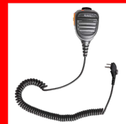
Remote Speaker Microphone SM26M1