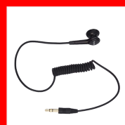
Receive-Only Earbud, 3.5mm plug ES-01