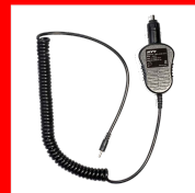
Vehicle Power Adapter CHV09