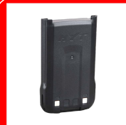
Li-Ion Battery (1650mAh) BL1719