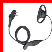
D-style Earpiece with in-Line MIC & VOX EHM15-A