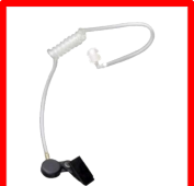
Replacement Earpiece Part with Transparent Acoustic Tube Kit POA156